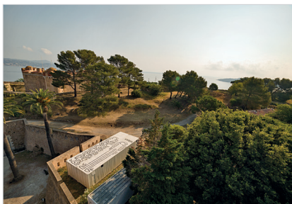
Pop Shop Tokyo, 1988 Mixed media on wood, plaster and steel 236 x 1200 x 496 cm