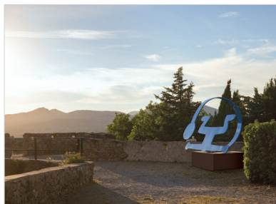
Untitled (Blue Curling Figure), 1985 Painted steel 205 x 343 x 225 cm

Artworks: © Keith Haring Foundation, 2021