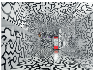
Pop Shop Tokyo, 1988 Interior Mixed media on wood, plaster and steel 236 x 1200 x 496 cm