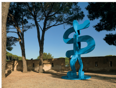
Untitled (S-Man), 1987 Painted steel 370,8 x 218,4 x 226,1 cm Edition on 3