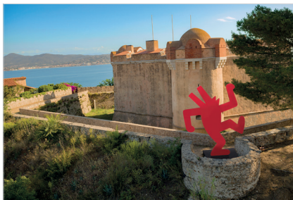
Untitled, 1989 Painted steel 411,5 x 322,6 x 3,8 cm