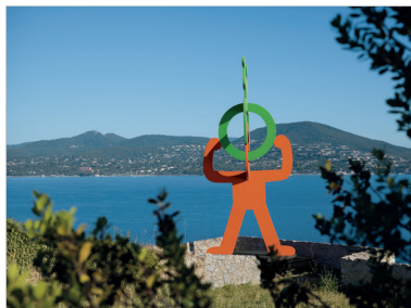
Untitled (Headstand), 1987-1988 Painted steel 700 x 300 x 300 cm