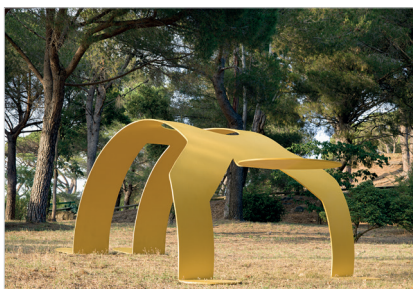
Untitled (Yellow Arching Figure), 1985 Painted steel 189 x 528 x 307 cm

Artworks: © Keith Haring Foundation, 2021