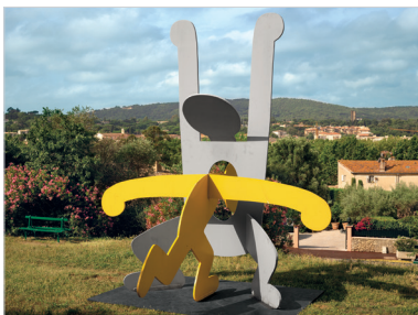
Untitled (Head Through Belly), 1987 Painted steel 750 x 640 x 630 cm